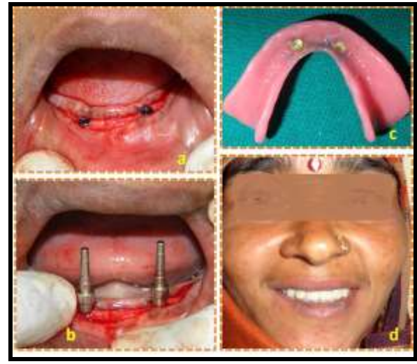
Figure 2: (a) Implant abutment in place (b) Implant analogue for impression (c) Mandibular denture with attachment (d) Implant supported mandibular overdenture with opposing maxillary conventional complete denture

In the second stage, exposure of the implant fixture was done (Fig 2a, b), following which cover screws were removed and implant sites were irrigated. Collars for healing were fixed for a period of four weeks to allow the surrounding tissue to mature and heal. Mandibular denture was further relined with a soft liner and the denture was placed. In the next