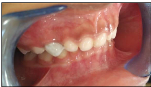
Figure 7:- After final placement of composite tooth pontic using polyethylene fibre