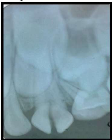
Figure 3:- Radiographic presentation

Radiographically, root was seen to be unaffected and did not show any sign of fracture or pathology. Hence, its preservation was thought to be an option for maintaining the space. [Figure 3]