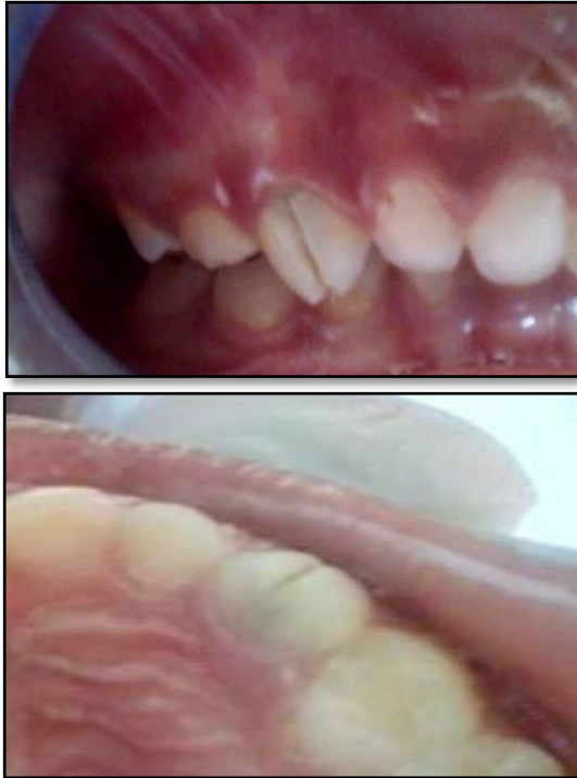
Figure 2:- Intraoral clinical presentation of the patient

segments. The segments were grade III mobile with discolouration on the palatal surface and no sign of bleeding, swelling or pain in the region of the tooth on the day of examination. [Figure 2]