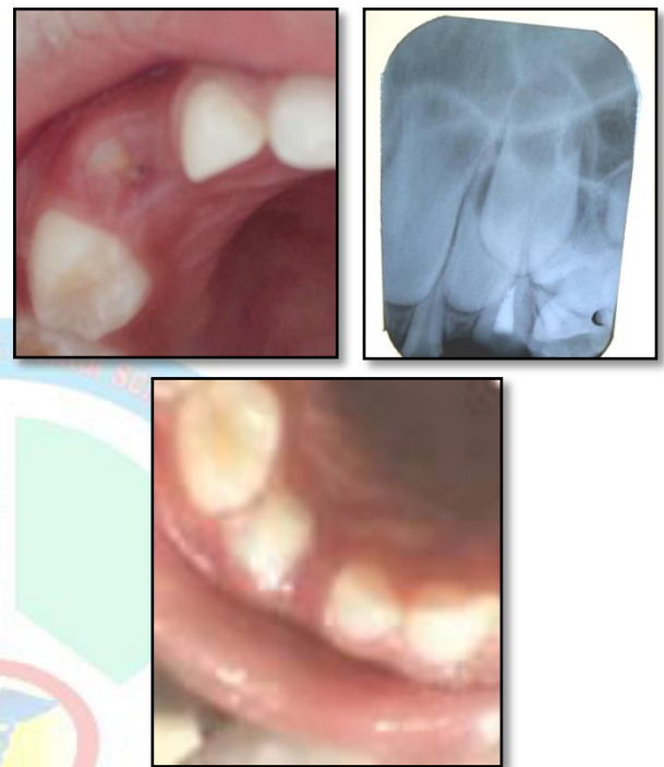
Figure 5:- Post-extraction of crown segments, completed pulpectomy treatment, GIC button placement

After attaining the consent from the parent, the fractured crown segments were extracted under local anaesthesia. Next, endodontic treatment i.e. pulpectomy was done followed by placement of Glass ionomer cement button. [Figure 5] A composite tooth (X-A2 shade of SolarX) was used as a pontic as a replacement of the crown and was fabricated using indirect technique. [Figure 6] Composite tooth pontic was attached to the adjacent natural using polyethylene fibre which a type of a fibre reinforced composite material (Ribbond, bondable reinforcement ribbon). Acid etching of the adjacent teeth was done with 37% of phosphoric acid, bonding agent was applied which was cured for 20 seconds. The fibre was