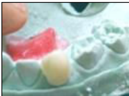
Figure 6:- Fabrication of composite tooth using indirect method

measured, cut and made into a fan shaped end to increase the surface area for adhesion. It was adhered to the adjacent natural teeth using composite on the palatal surface. The occlusion was checked to ensure complete comfort for the patient. [Figure 7]