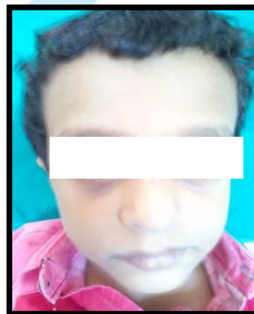
Figure 1: Extraoral photograph of the patient

A five year old child reported to the Department of Paedodontics & Preventive Dentistry with a complaint of broken front tooth. [Figure 1]