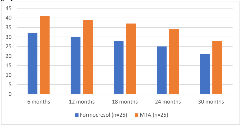
Fig 2: Radiographic success rate