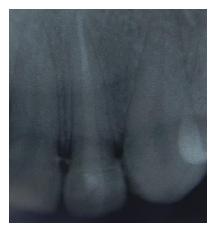
Fig 7c: Postoperative Radiograph