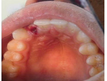
Fig 3 a: Mobile fragment removed