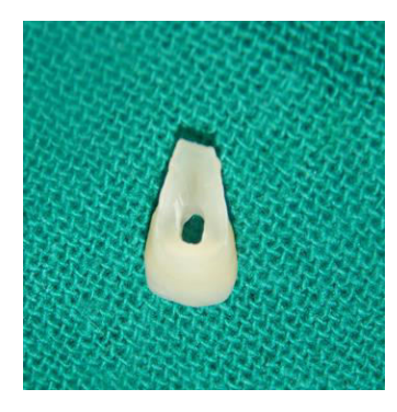
Fig 6b: Access preparation

Fig 6a: Fitting of Post into the post space