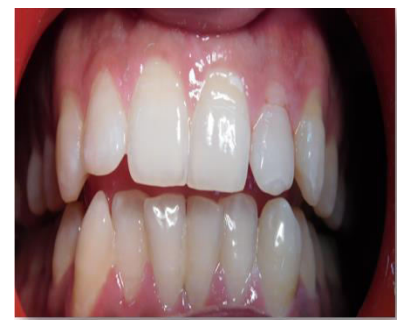
Fig 1a: Preoperative labial view

transillumination test. Prior to treatment, detailed dental, medical history were obtained and was noncontributory. Diagnosis of Ellis class III fracture was made as the pulp was involved.It was planned for single visit root canal treatment and reattachment of fractured fragment to the same tooth. Treatment plan was discussed with the patient and, informed consent was signed.