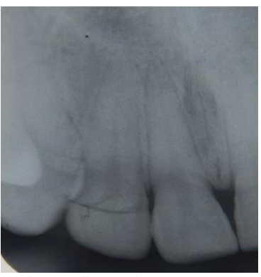
Fig 2: Preoperative Radiograph

After administration of local anesthesia, mobile fracture segment was removed (Fig 3a, 3b) and to prevent discoloration and dehydration it was stored in sterile distilled water. Using endo access bur (DENTSPLY maillefer, Switzerland) access opening was done on the tooth no.22,working length was determined using apex locator and was confirmed by radiograph, root canal was enlarged to ISO size 60 at working length ,complete biomechanical preparation was performed using step back technique, and thorough irrigation was done with 2.5% Sodium hypochlorite during the preparation,master cone