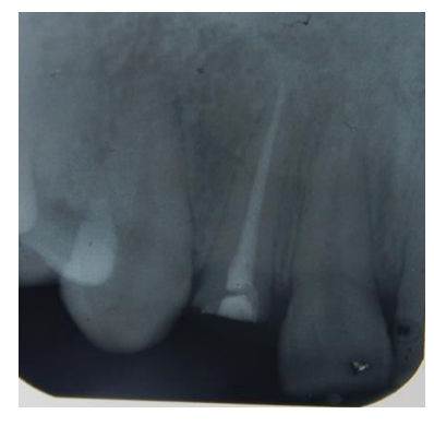
Fig 4: PostObturation Radiograph