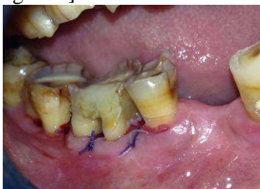
Figure 4: Shows mucoperiosteal flap was placed at tooth -bone junction and 5-0 resorbable vicryl suture placed.

Complete debridement of granulation tissue and scaling and root planning was done. Interradicular osteotomy was done with round bur and tunnel was prepared and then the flap was repositioned on the alveolar crest and 5-0 resorbable vicryl sutures were given [Figure 4].