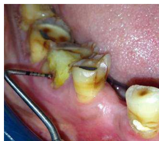
Figure 1: Clinical presentation of 46 with horizontal probing depth 9 mm.

involvement in the right 1 st mandibular molar reported in department of periodontics, Manubhai Patel Dental College, Vadoadara. He was referred from endodontic department after endodontic treatment for further periodontal treatment as it was endo- perio lesion. According to clinical [figure 1] and radiographic examination [figure 2], horizontal bone loss in the interradicular area and presence of divergent roots were observed.