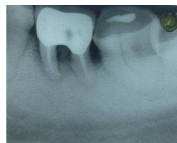
Figure 8: Intraoral periapical radiograph of 44 tunnelled crown after 6 months