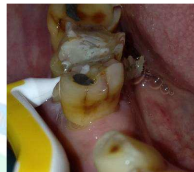
Figure 6: Shows interproximal brush going through the furcation for patient maintenance

Ni Cr Crown was placed after 1 month of surgery. Patient is on regular follow-up at 6 months post-operative. [Figure 7 and 8].