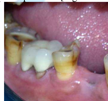
Figure 7: Clinical aspect of tunnelled crown at 6 months

Ni Cr Crown was placed after 1 month of surgery. Patient is on regular follow-up at 6 months post-operative. [Figure 7 and 8].