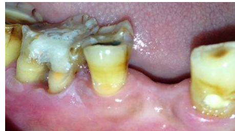
Figure 5: Clinical aspect showing uneventful healing after 1 month

plaque control (60 second rinses with 2% chlorhexidine) and patient was given interproximal brush to maintain furcation area [Figure 5 and 6].