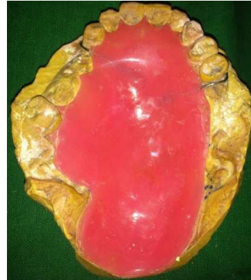
Figure 10: Prosthesis with Retentive components and Soft liner