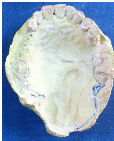
Figure 4: Cast obtained using dental stone