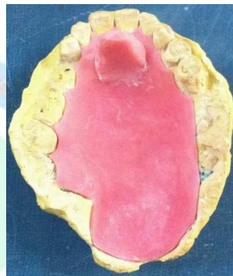
Figure 5: Custom Tray with Handle Fabricated