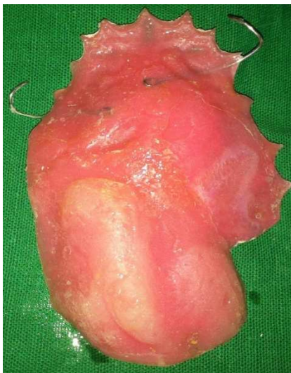
Figure 9: Tissue side of Prosthesis with Soft liner