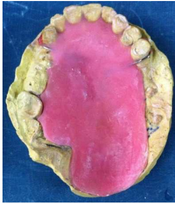
Figure 7: Retentive components incorporated in the Acrylic Plate