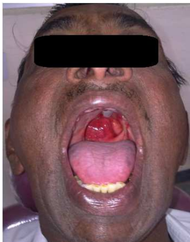
Figure 1: Frontal view - visualizing the defect