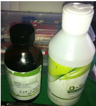
Figure 8: Soft liner used for lining the defect area