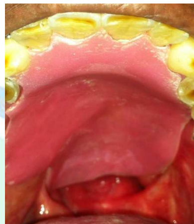
Figure 11: Prosthesis Tryin Done