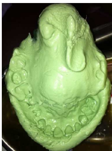
Figure 3: Alginate Impression made