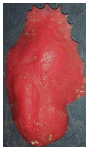
Figure 6: Tissue side of custom tray