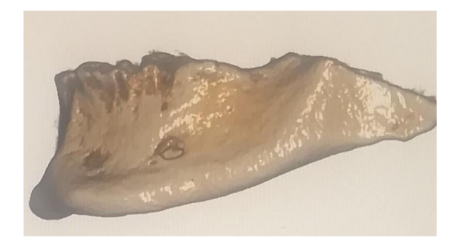
Fig 2: Cross-section view

Fig 1: Lateral view of mandible with mental foramen