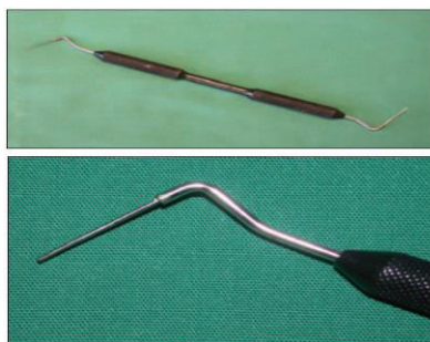
Figure 2: Buchanan plugger

Mechanical removal – This is an efficient and probably the most commonly used technique, but it is a technique that can result in the most damage to tooth tissue. A non-end cutting bur such as a Gates-Glidden or Peeso reamer should be used for gutta-percha removal, as these will cut and remove the relatively softer gutta-percha preferentially to the dentine of the canal walls. 13